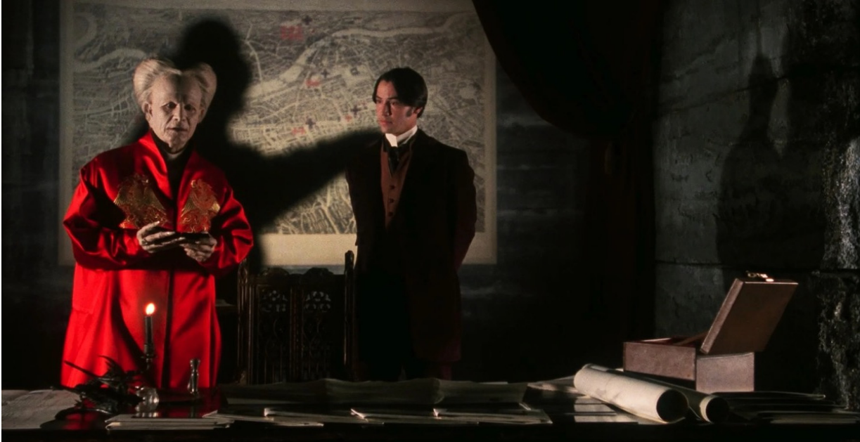
Figure A. Bram Stoker's Dracula , Columbia Pictures, 1922.

Study the still image in Figure A . It is a still image where the lighting and sharp shadows dominate the scene.